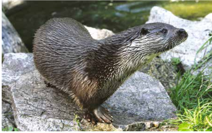
CNR participates in the protection of animal species

CNR is convinced of the need to democratise environmental dialogue . Thus it works to involve all the stakeholders and civil society, from the formulation of projects to their construction and beyond.