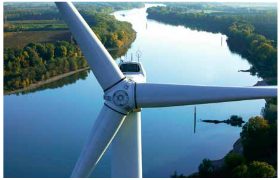
Beaucaire wind farm