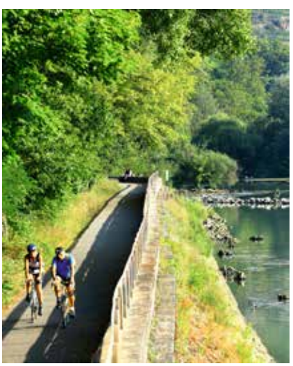
Soft mode itineraries on the ViaRhôna near Condrieu

Our contribution to the influence of the Rhone valley also involves actions to develop tourism . We promote river and industrial tourism by assisting, through partnerships, local authorities and associations that wish to enhance their territory.