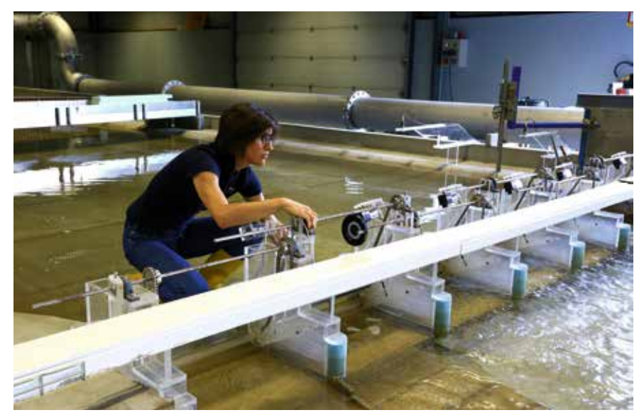
Study using a physical model to understand erosion phenomena downstream of Donzère dam