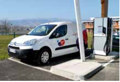
CNR electricity charging point at Bourg-lès-Valence